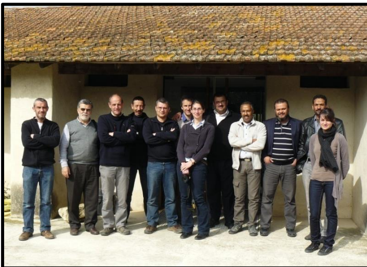
Participants in the meeting of North African IWC NCs from 9 to 11 April 2013 at Tour du Valat (France) on Databases and synthesis of IWC 2013.