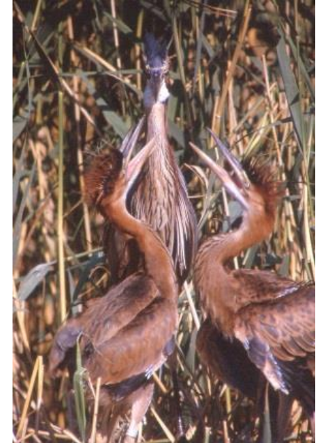
Four weeks chicks