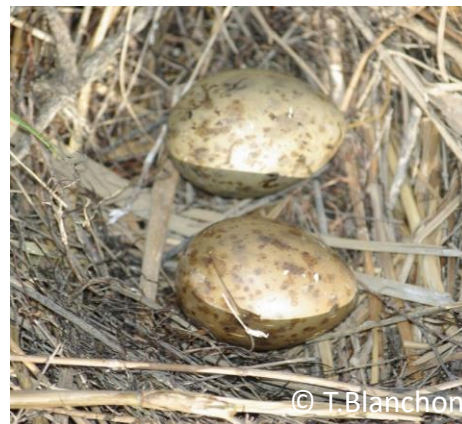
Nest with eggs

Similar species: Slender-billed Gull, Mediterranean Gull.