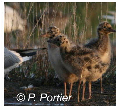
2 nd week