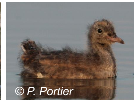
3 rd week