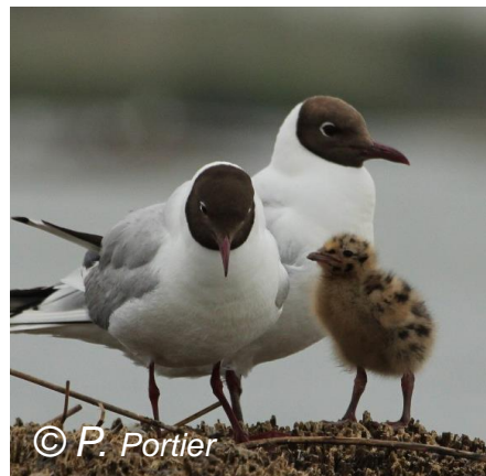
1 st week