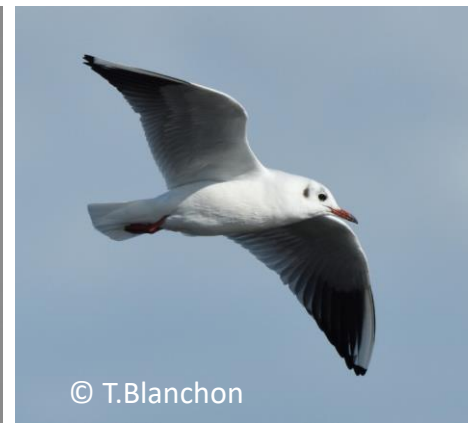
Non breeding adult