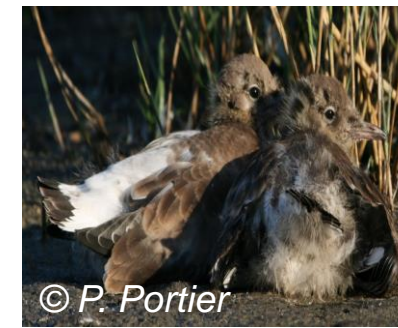
4 th week