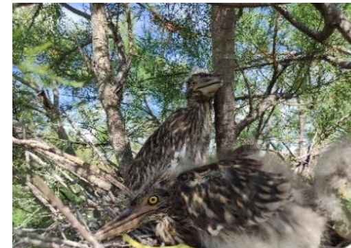
Poussins de 3 semaines