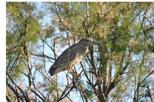
Poussin de 4 semaines