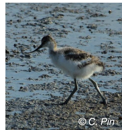
3 rd week