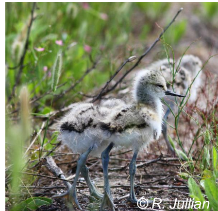
1 st week