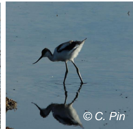
4 th week