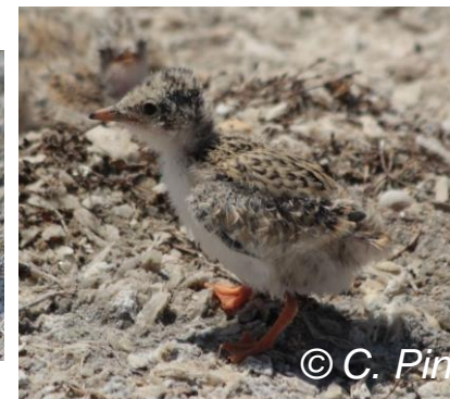
2 nd week