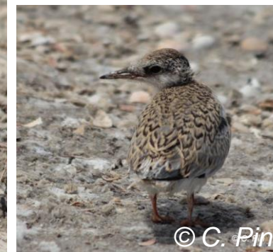
3 rd week