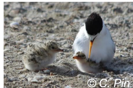
1 st week